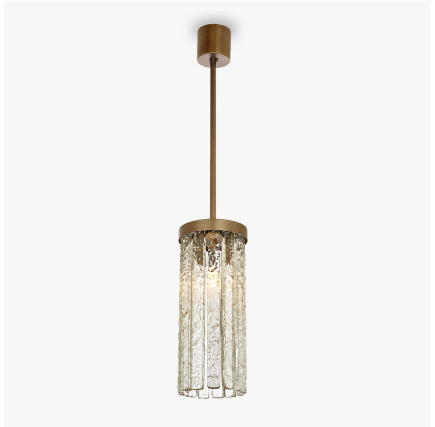
CL455 in Clear Hammered Murano Glass and Brushed Dark Bronze

UL (Underwriters Laboratories) test certificates available for the USA - will incur a surcharge