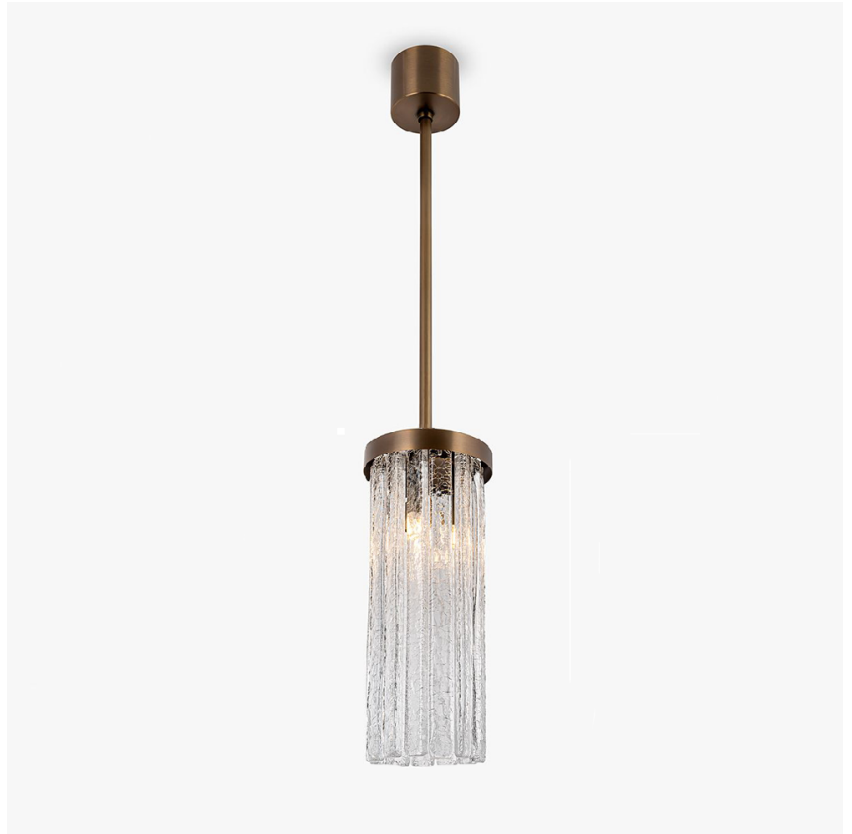
CL455 in Clear Crackled Glass and Brushed Dark Bronze

UL (Underwriters Laboratories) test certificates available for the USA - will incur a surcharge