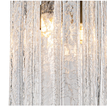
Clear Cracked (Flat)