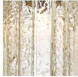
Clear Hammered (Flat)