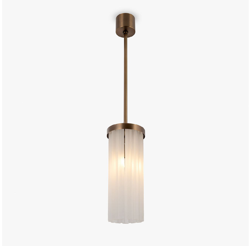
CL455 in Satin Triangular and Brushed Bronze

IEC (International Electrotechnical Commission) test certificates available - will incur a surcharge UL (Underwriters Laboratories) test certificates available for the USA - will incur a surcharge