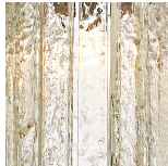
Clear Hammered (Flat)