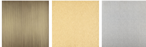
Brushed Dark Bronze Brushed Gold Brushed Nickel