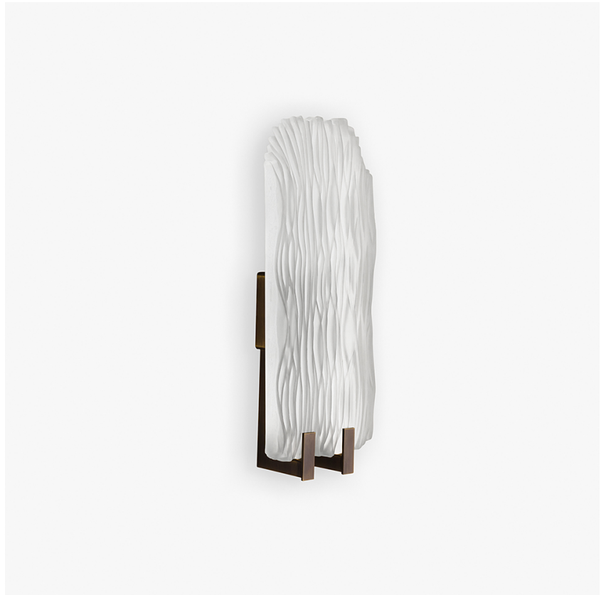
WL211-RECT in satin glass and brushed dark bronze

Yacht Club Image not found or type unknown