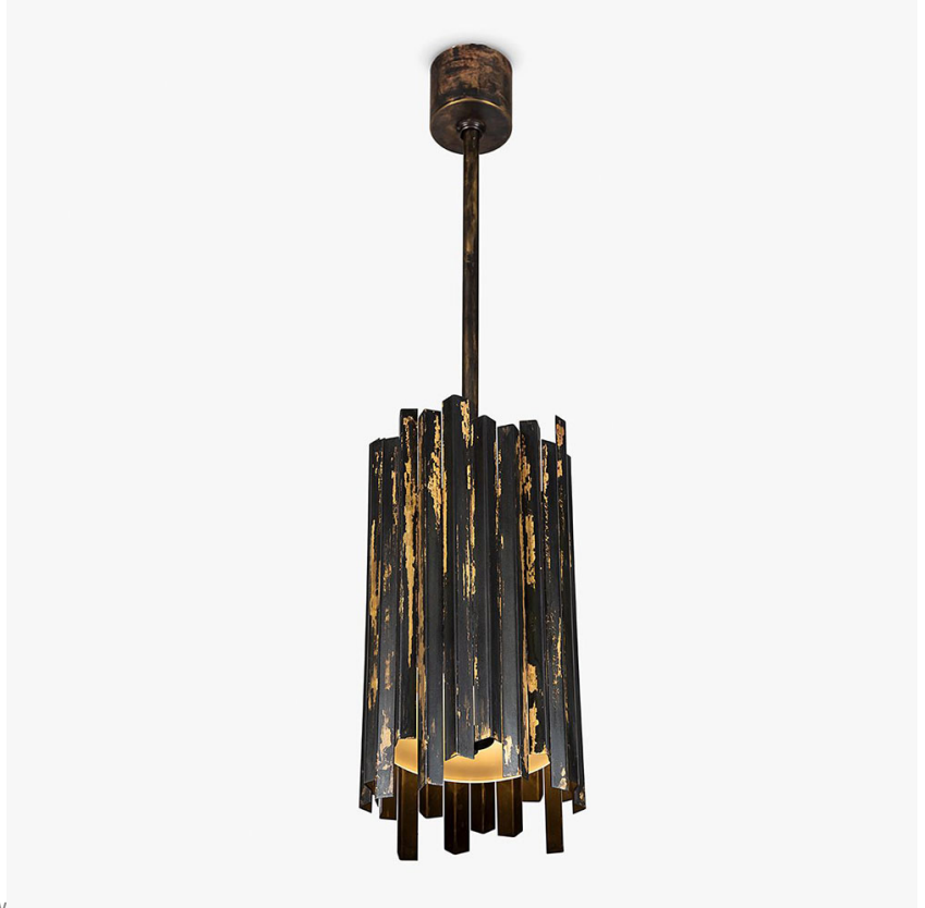
CL114-PEN in distressed bronze with a Lucite diffuser

Bathroom Bathroom Yacht Club Bathroom Yacht