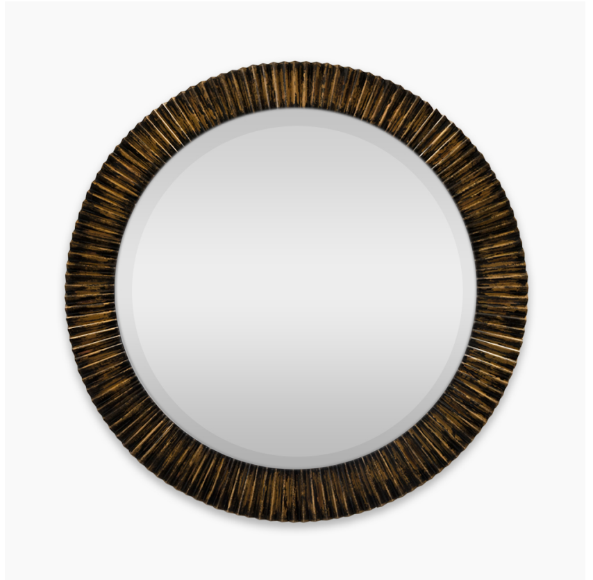
Concertina Straight Mirror in Distressed Bronze

A more contemporary piece designed in a distressed bronze finish from the brutalist era of the 1970s. Encompassing the glass is a multitude of brass v-shaped strips welded together to create a subtle lighting effect.