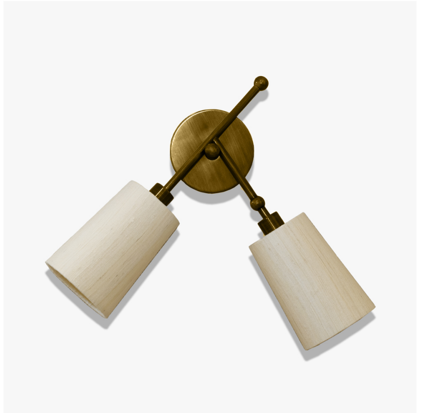
WL811 in Brushed Bronze with 6" Copernicus Shades in James Hare Vyne Silk 31625-01