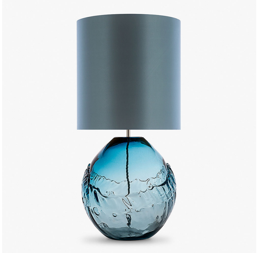
TL238 in Ocean Blue Glass and Brushed Nickel with a 12" Tall Drum Shade in Crepe Satin 1806W/0312 Mist