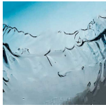
Crest Ocean Blue