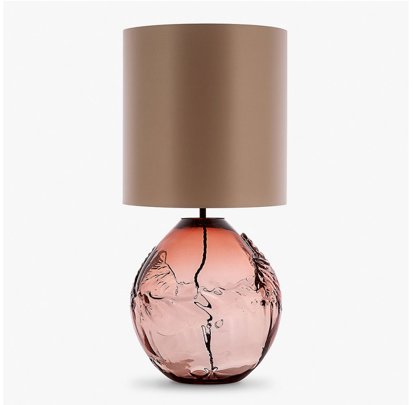
TL238 in Tea Glass and Brushed Dark Bronze with an 12" Tall Drum Shade in Crepe Satin 1806W/012 Frosted Almond