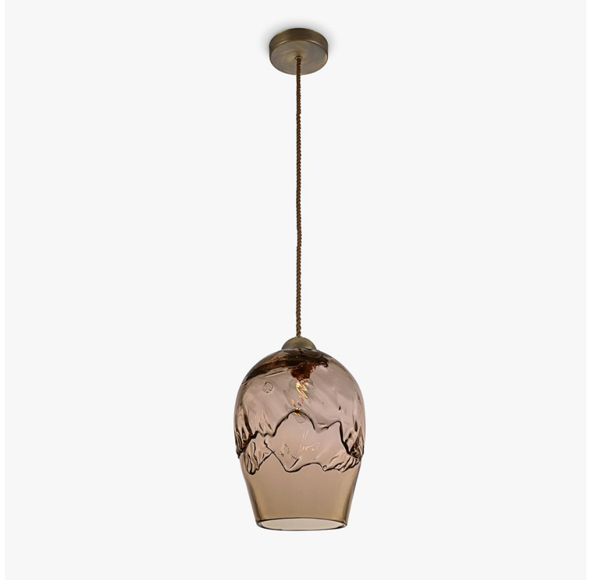
CL238 in Bronze and Brushed Bronze with Brown Flex

Rolling waves tumble and break over the dome of these atmospheric glass pendants which feature a hot finished edge, preserving the molten fluidity of the glass. These temperate waves are the perfect antidote to the tumultuous storm captured within its table lamp counterpart: the calm before the storm.