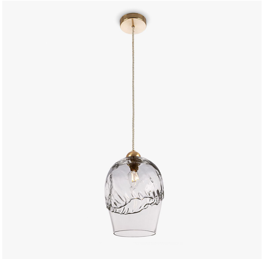
CL238 in Clear Glass and Brushed Gold with Silver Flex

Finish note: As these pendants are handmade by our artisans in England and are a unique design, each pendant varies slightly in design and size from one another