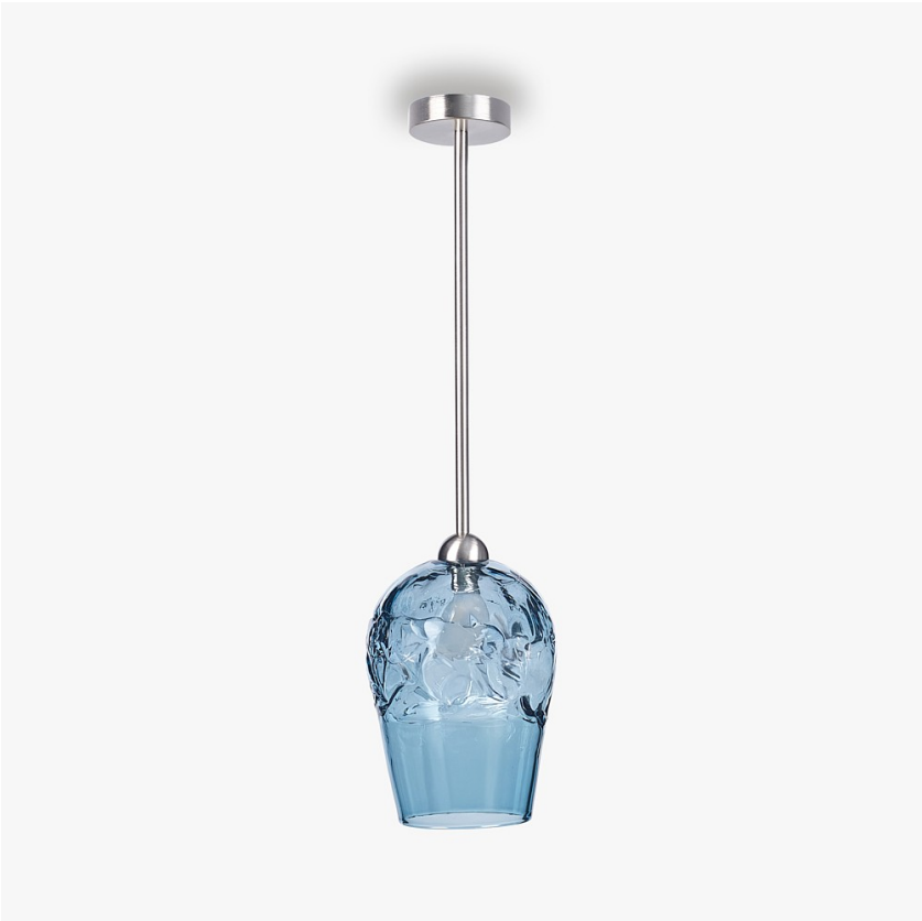
CL238 in Ocean Blue and Brushed Nickel

Rolling waves tumble and break over the dome of these atmospheric glass pendants which feature a hot finished edge, preserving the molten fluidity of the glass. These temperate waves are the perfect antidote to the tumultuous storm captured within its table lamp counterpart: the calm before the storm.