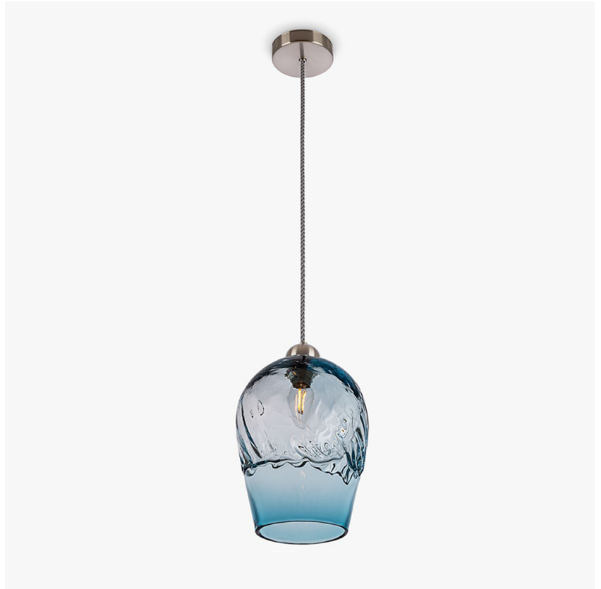
CL238 in Ocean Blue Glass and Brushed Nickel with Silver Flex

Finish note: As these pendants are handmade by our artisans in England and are a unique design, each pendant varies slightly in design and size from one another