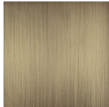
Brushed Dark Bronze