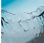
Crest Ocean Blue