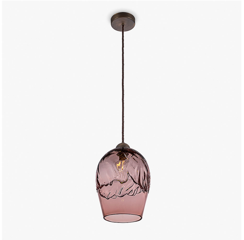
CL238 in Tea Glass and Brushed Dark Bronze with Brown Flex

Finish note: As these pendants are handmade by our artisans in England and are a unique design, each pendant varies slightly in design and size from one another