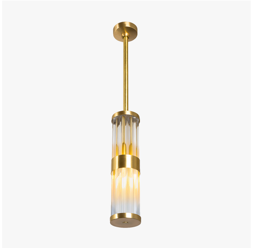
CL121-PEN-12 in Clear Lucite and Brushed Gold

Modelled on our iconic Curzon Street chandelier the new Curzon Street pendant is a welcome addition to the range. With its long, slender design this would look elegant and chic in any given interior. Available in either clear or frosted Lucite and a number of sizes.