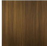
Antique Brushed Brass