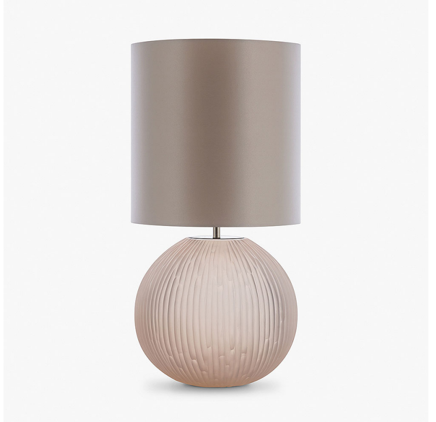
TL236 in Blush Pink glass and brushed nickel with an 11" tall drum shade in crepe satin 1806W/403 Lilac Grey