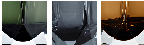
Forest Green & Clear Slate & Clear Tobacco & Clear