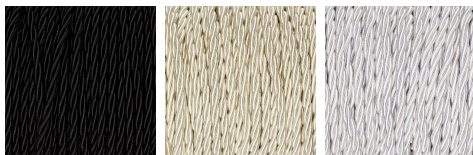
Black Cream Silver