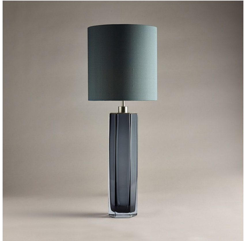
TL704-LA in Slate & Clear with Brushed Nickel and 12" Tall Drum in Bennett's 5018W-818 Alpine