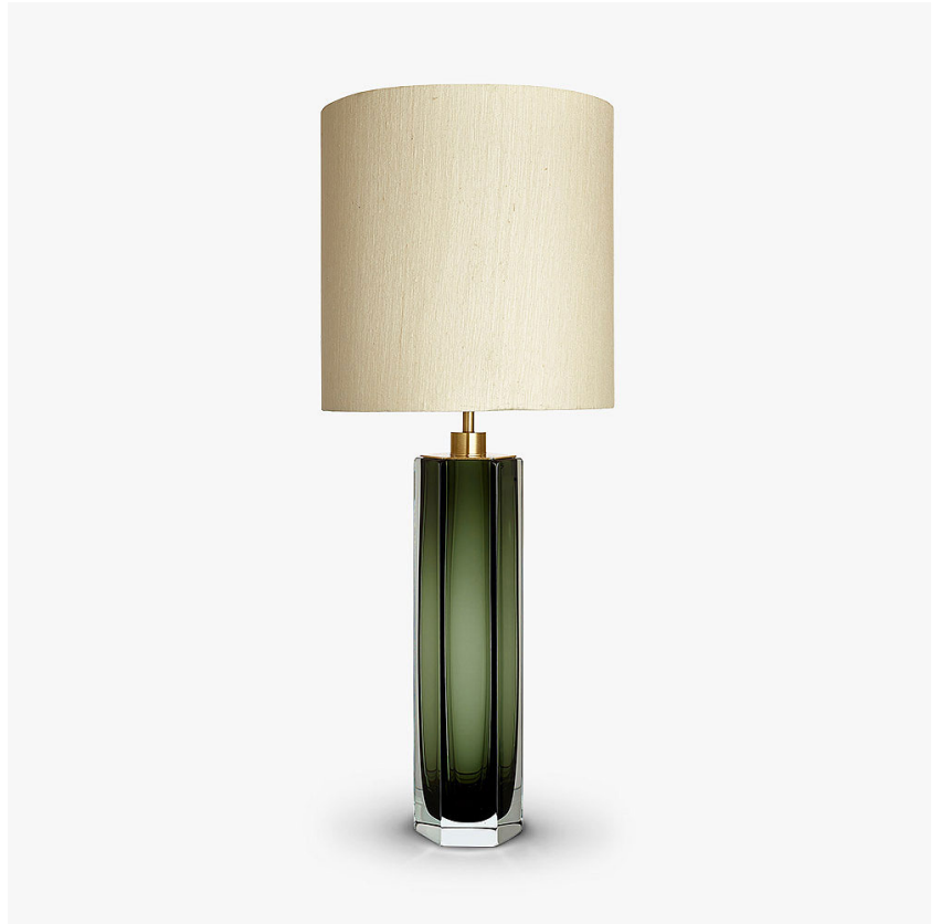
TL704-LA in Forest Green & Clear with Brushed Gold and 12" Tall Drum Shade in Silk Linen 3998/W White