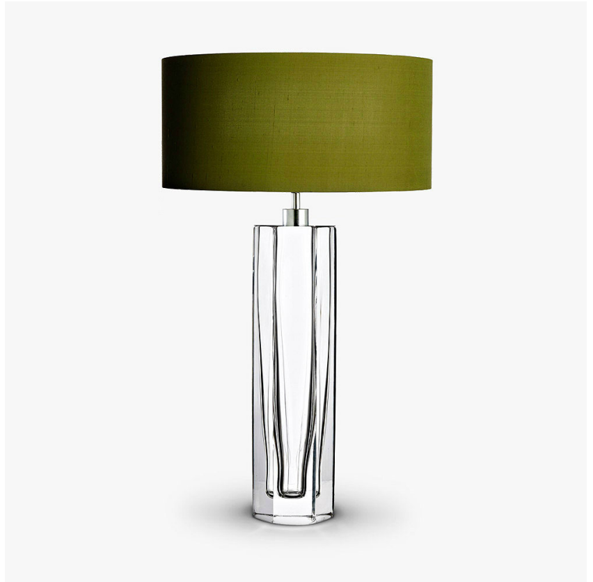
TL704 in Clear Murano Glass and Brushed Nickel with a 16" Short Drum Shade in 5018W-202