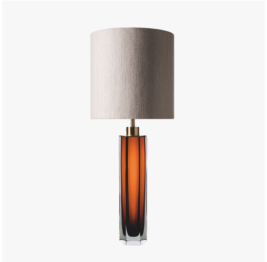
TL704-SM in Tobacco & Clear Murano Glass with a Brushed Gold Top and a 10" Tall Drum Shade in 3998W White