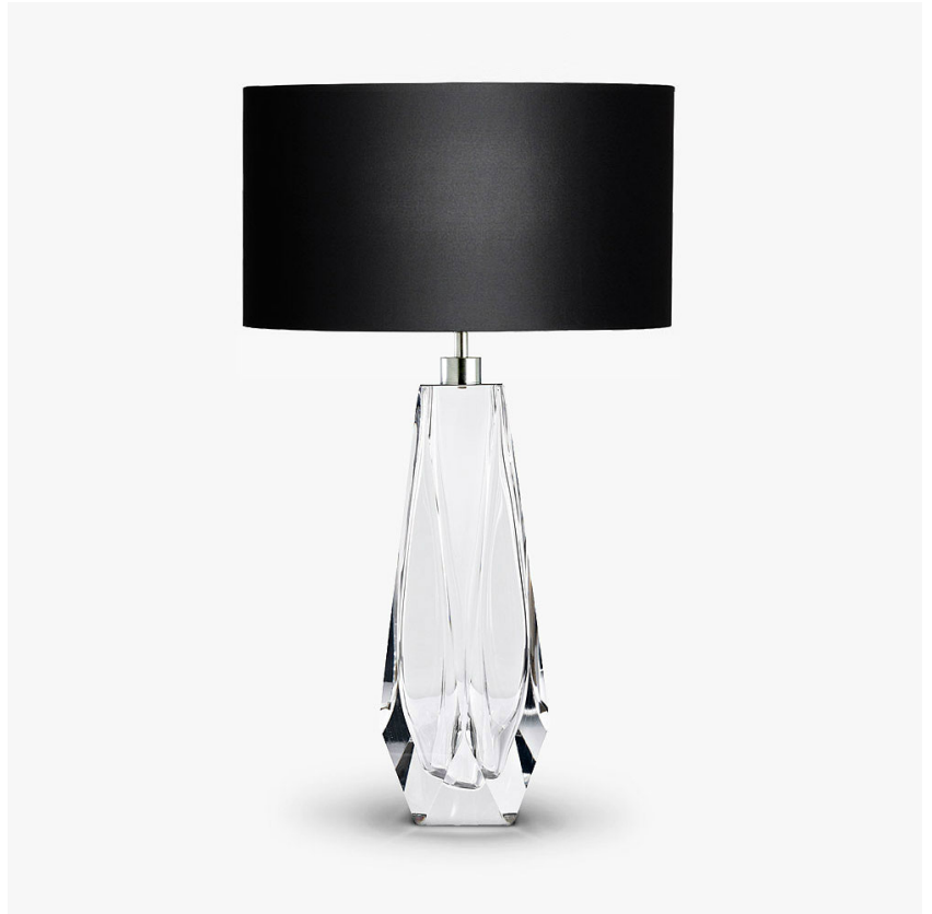
TL702 in Clear Murano Glass with a 15" Drum Shade in Silk Crepe Satin 1806W-21 Slate