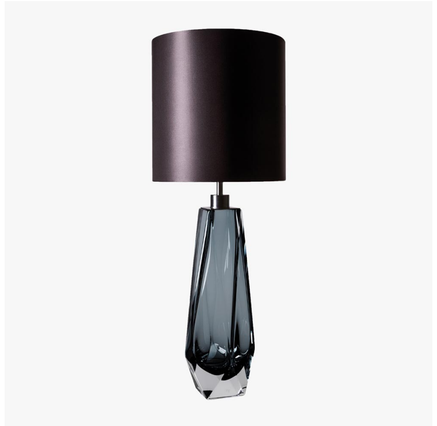
TL702 in Petrol Blue & Clear and Brushed Nickel with 11" Tall Drum Shade in Bennett Silks Crepe Satin 1806W-86 Prussian