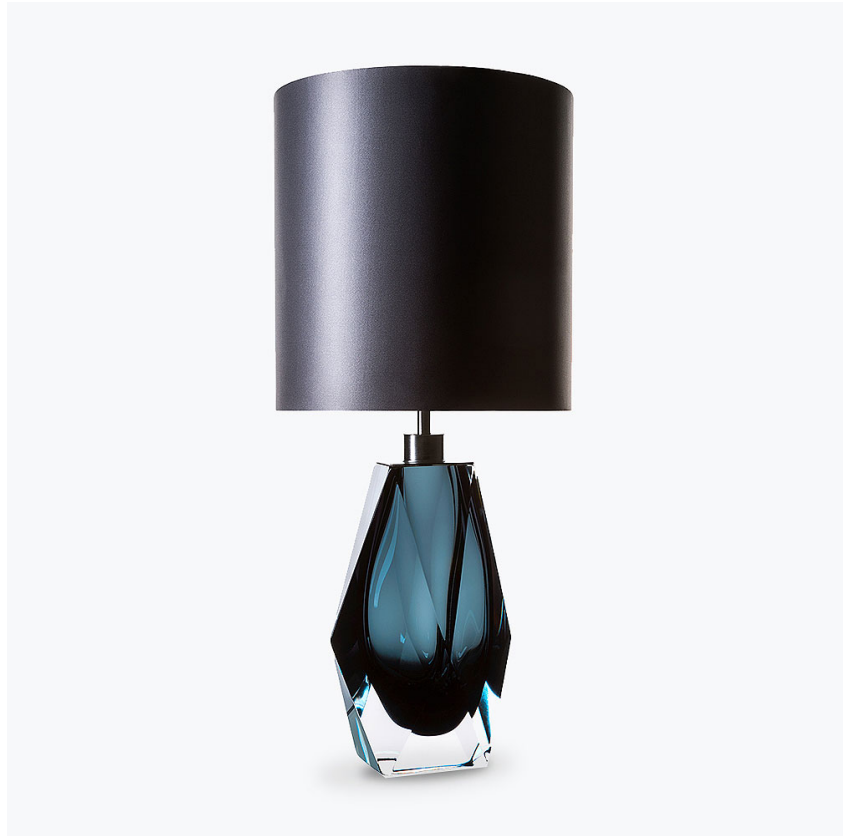
TL701 in Petrol Blue & Clear with Brushed Nickel Top with a 11" Tall Drum Shade in Silk Crepe Satin 1806W-86 Prussian