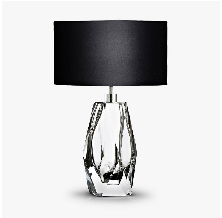
TL701 in Clear Murano Glass and Brushed Nickel with a 15" Oval Shade in Silk Crepe Satin 1806W-52 Black