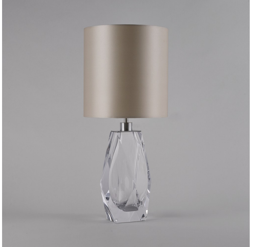
TL701 in Clear and Brushed Nickel with 11" Tall Drum in Bennett's 1806W-4501 Platinum