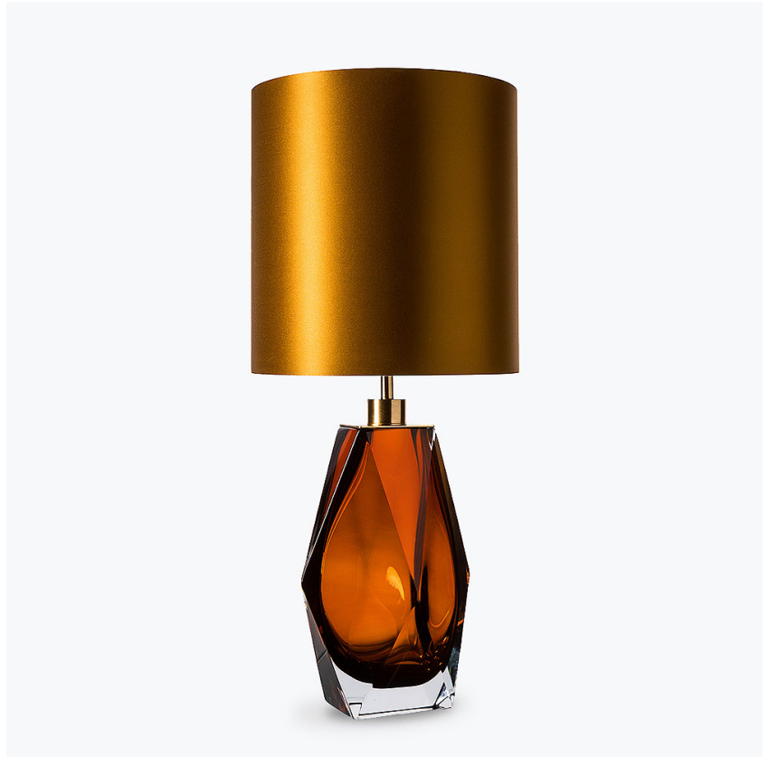
TL701 in Tobacco & Clear Murano Glass and Brushed Gold with an 11" Tall Drum Shade in Silk Crepe Satin 1806W-70 Ochre