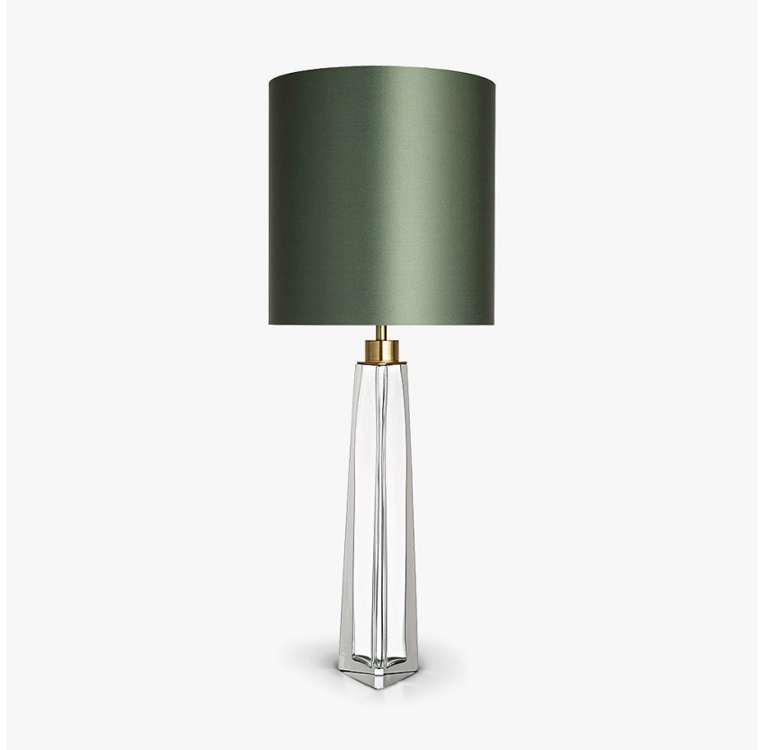
TL708 in Clear and Brushed Gold with 11" Tall Drum 1806W-120 Dill