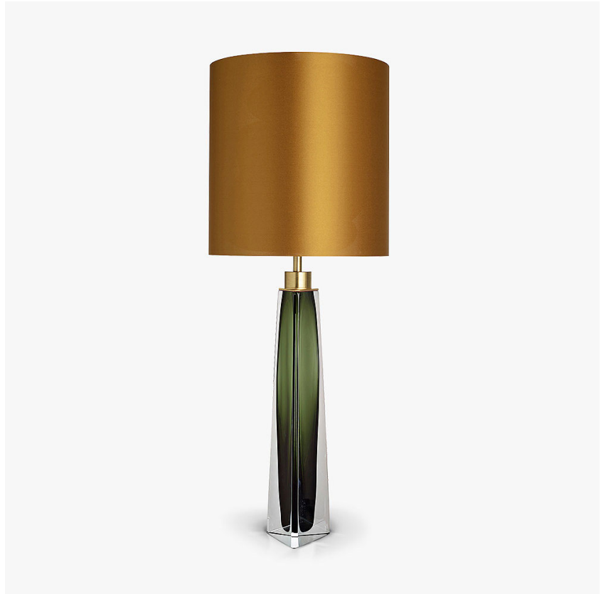
TL708 in Forest Green and Clear Murano Glass and Brushed Gold with a 11" Tall Drum Shade in 1806W/ 70 Ochre