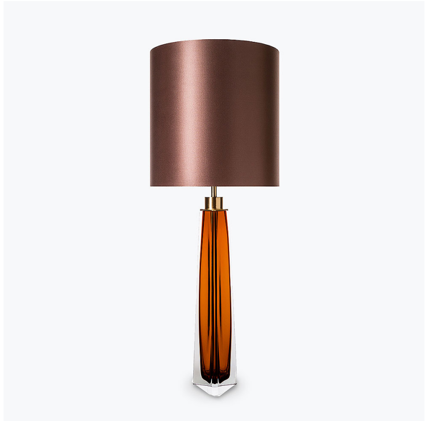
TL708 in Tobacco and Clear Murano Glass and Brushed Gold with a 11