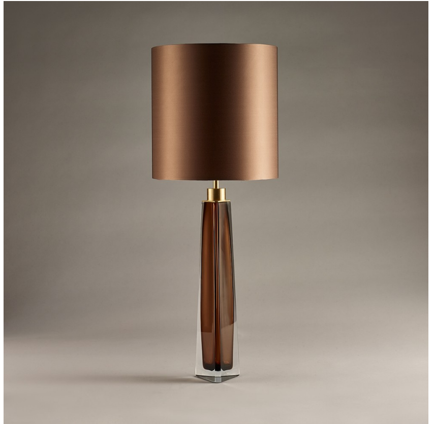
TL708 in Tobacco & Clear and Brushed Gold with 11" Tall Drum in Bennett's 1806W-326 Nutmeg