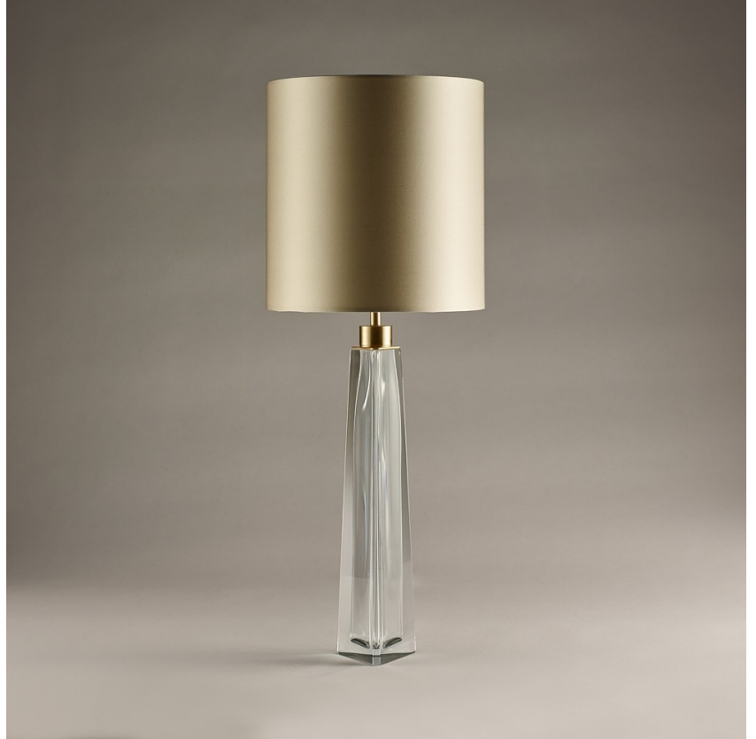
TL708 in Clear and Brushed Gold with 11" Tall Drum in Bennett's 1806W-4501 Platinum