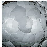
Slate & Clear (Round)