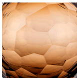
Tobacco & Clear (Round)