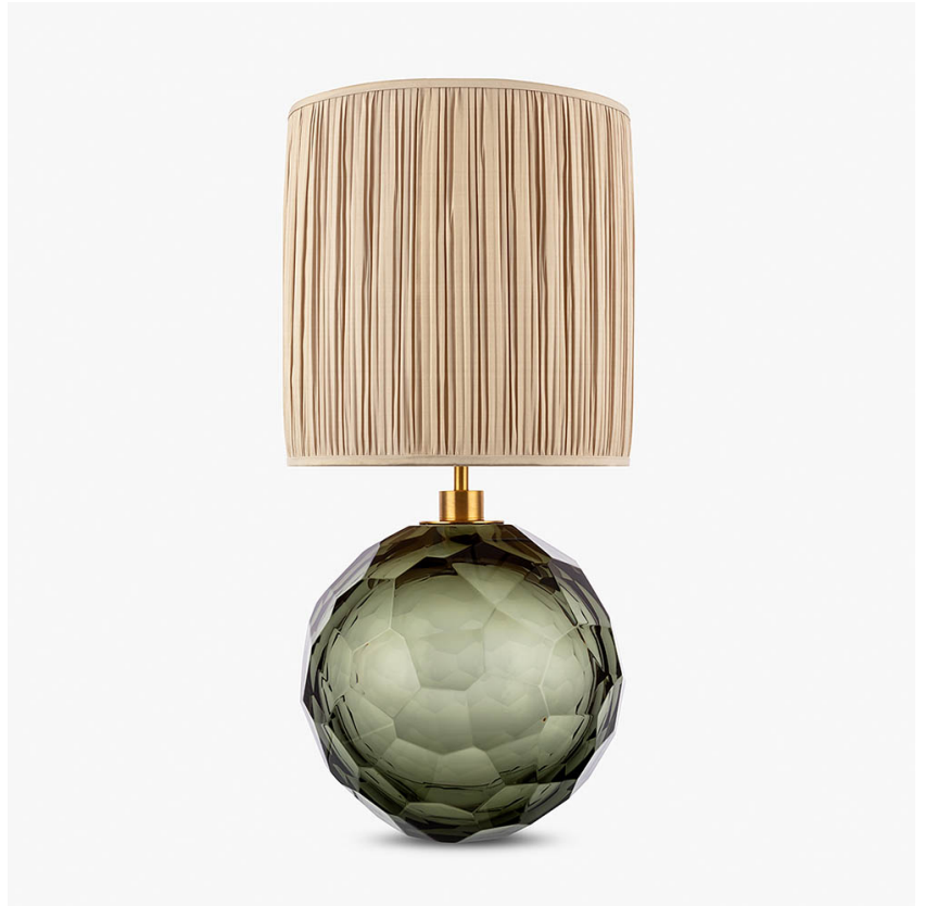
TL710-LA in Forest Green & Clear with Brushed Gold with a 12" Tall Drum Shade in Pleated James Hare 38000/103