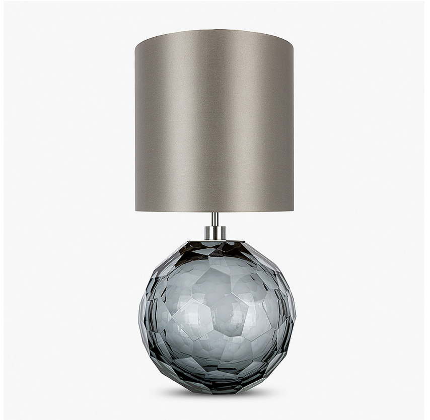
TL710-LA in Petrol Blue & Clear with Brushed Nickel with a 12" Tall Drum Shade in 1806W/ 44 Silver