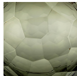
Round Forest Green & Clear