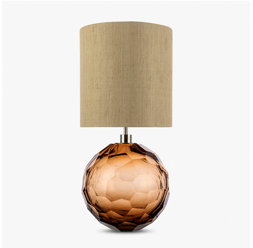
TL710-LA in Tobacco and Clear and Brushed Nickel with a 12" Tall Drum Shade in 3998