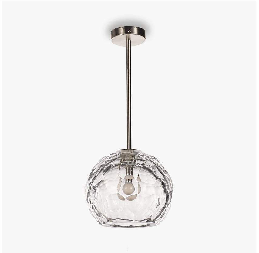
CL710 in Clear and Brushed Nickel

This pendant version of our Diamond Round Table Lamp is the very first time a design from our iconic Beverly Hills collection has been adapted for ceilings. The elegant, faceted ball shape allows the light to refract and form a beautiful honeycomb pattern. Hand-crafted out of layered Murano glass and then polished by hand for up to 12 hours, each piece is a one-of-a-kind of unrivalled quality.