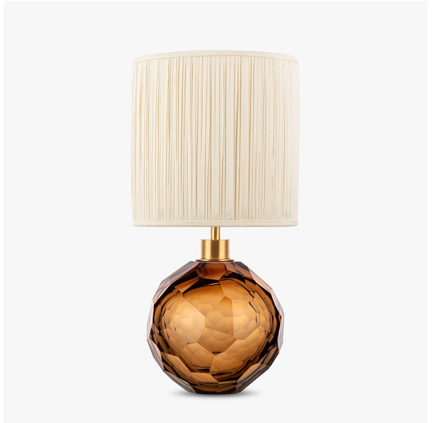
TL710-SM in Tobacco & Clear and Brushed Gold with 9" Tall Drum Shade in Pleated James Hare 38000/01