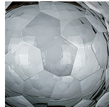
Slate & Clear (Round)