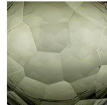
Forest Green & Clear (Round)