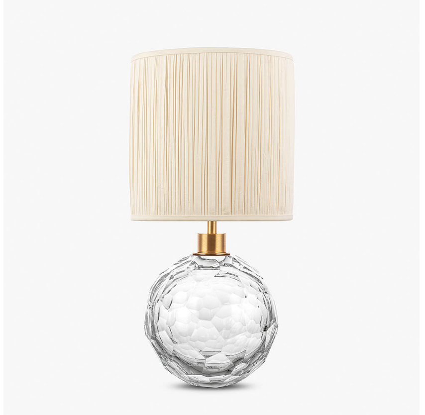
TL710-SM in Brushed Gold and Clear Glass with 9" Tall Drum Shade in Pleated JH3800/01 Ivory