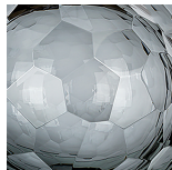
Round Petrol Blue & Clear