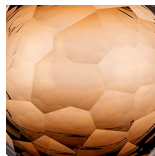
Round Tobacco & Clear