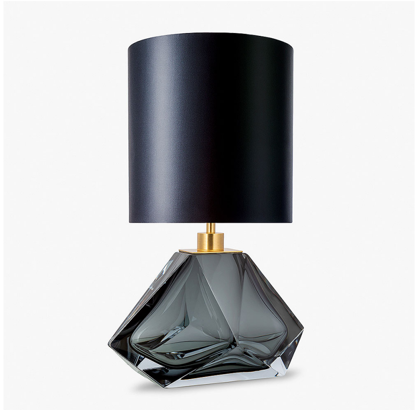
TL700 in Slate & Clear and Brushed Gold with 11" Tall Drum in 1806W-019