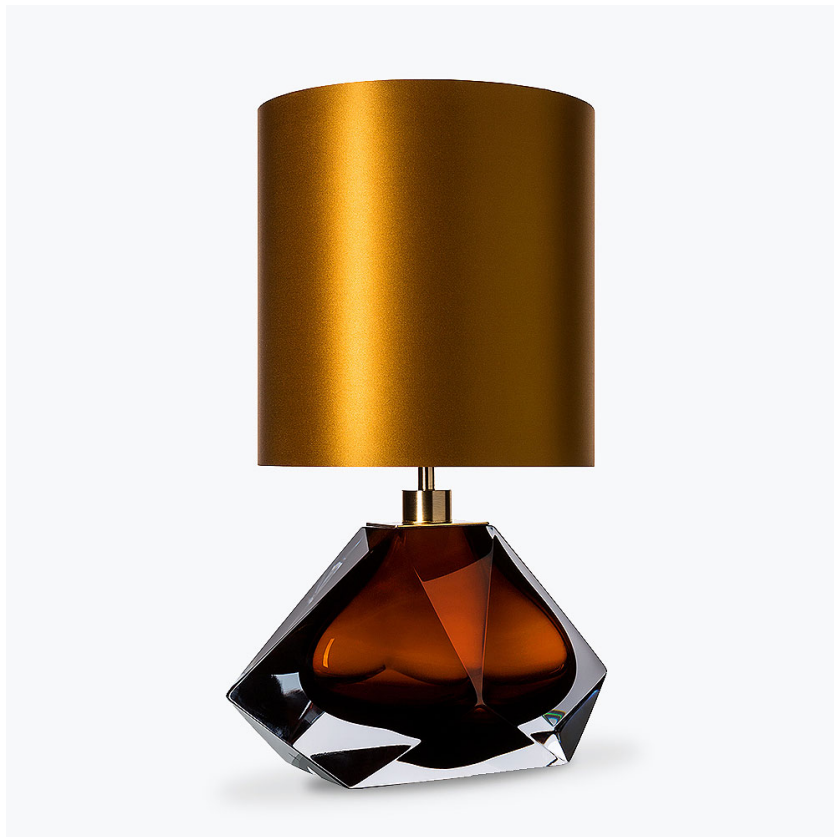
TL700 in Tobacco & Clear Glass and Brushed Gold with a 11" Tall Drum Shade in 1806W-70 Ochre