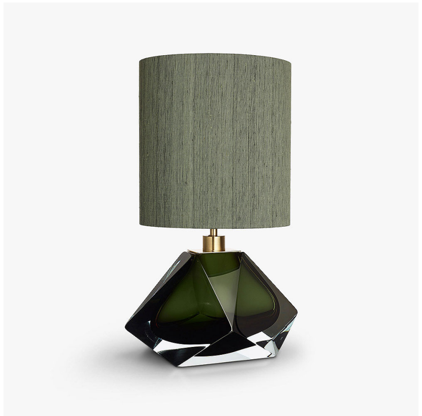
TL700 in Forest Green and Clear and Brushed Gold with a 11" Tall Drum Shade in Silk Linen 3998-0117 Vineyard Green