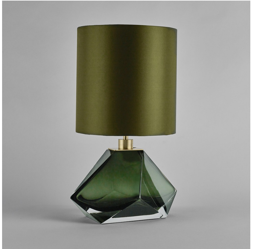
TL700 in Forest Green & Clear and Brushed Gold with 11" Tall Drum in Bennett's 1806W-120 Dill