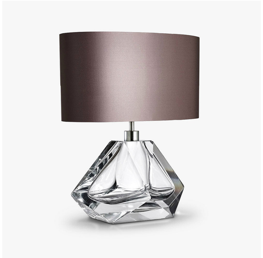
TL700 in Clear Glass and Brushed Nickel with a 15" Straight Oval Shade in Silk Crepe Satin 1806W-326 Nutmeg