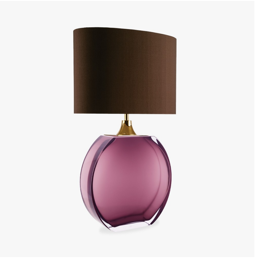
TL713-LA in Amethyst & Clear and Polished Gold with a 15" Oval 5018W/126