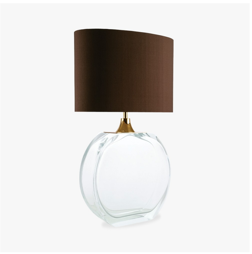
TL713-LA in Clear and Polished Gold with a 15" Oval 5018W/126