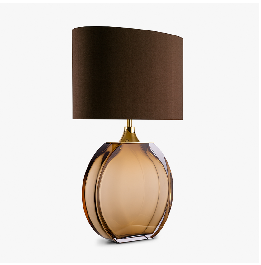
TL713-LA in Tobacco & Clear and Polished Gold with a 15" Oval 5018W/126